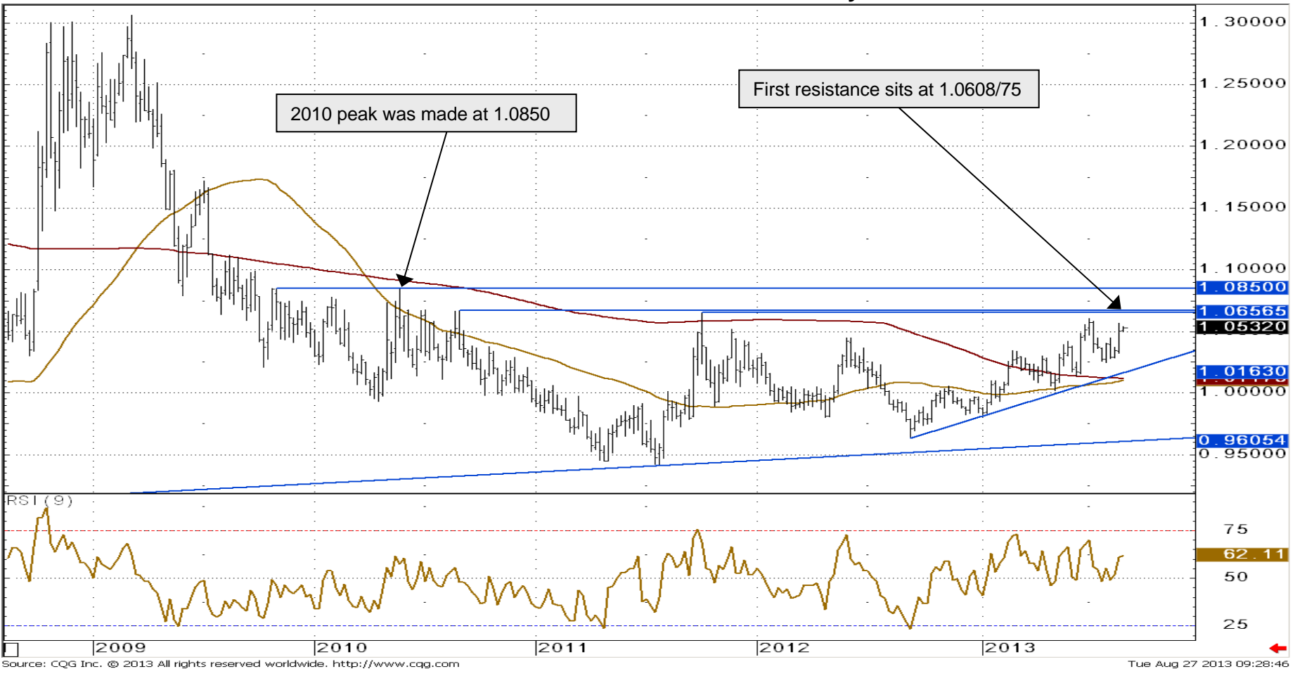
USD/CAD Weekly Chart

Is about to rise above this year's July peak at 1.0608